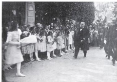
FIG. 4. — The Président de la République Française welcome by youth, ca. 1930 (M. Mille- rand). Such images must be produced and consumed like tranquilizers.

In the same way that Renaissance perspective certified the viability of a problematic welt anschauung , photographic images continue to support the fantasy that snapshot photographers and their subjects are participants in other than an alienating society. Because of the discrepancy between the wish and the actuality, the images must be produced and consumed steadily, like so many tranquilizers in a world of relentless