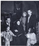
FIG. 2. — Le Passage des vieux , 1940. The distribution of such imagery legitimizes its content.